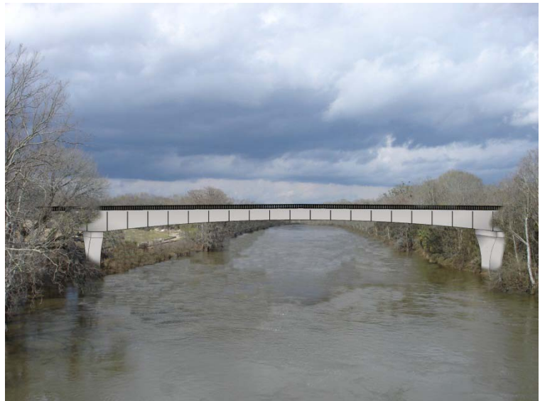
Rendering of Proposed Segmental Concrete Box Girder Bridge

Since that time, the Georgia Department of Transportation along with their consultant team headed by Heath & Lineback Engineers, Inc. determined that rehabilitation of the existing bridge was not feasible and has agreed to fund a replacement bridge. They have been diligently preparing the environmental and design documents to demolish the existing bridge and construct a Cast-in-Place Post Tensioned Segmental Concrete Box Girder bridge. At this time, the bid let date has been set for some time in December of 2011. This date is subject to modification as the review and approval of the Environmental Document is running concurrently with design development. It is anticipated that it will take approximately two (2) years to complete the demolition of the existing bridge and construction of the new bridge.